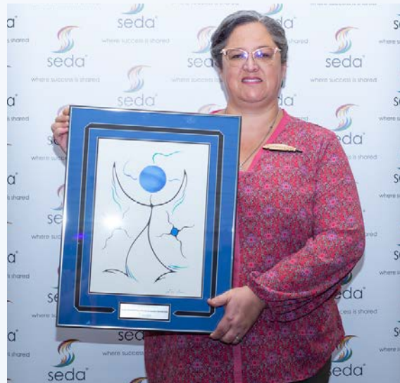
2022 Winner South Saskatchewan Ready Economic Partnership

This award was introduced in 2021, giving the SEDA Board Chair or Board of Directors as a collective whole the option to present an award to recognize individuals, organizations, or communities who have demonstrated a multiyear commitment to the vitality, growth, and sustainability of their locale and the province.